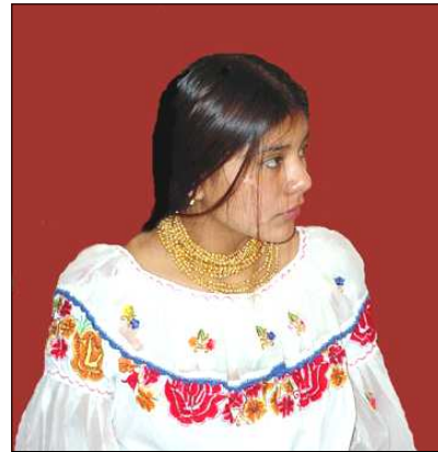
(Cayambe Indian who attends the Zabala Church in Ecuador)

"I thank my God every time I remember you...because of your partnership in the gospel" (Phil.1:3,5)