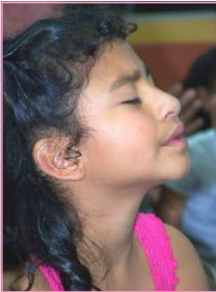
(Girl in the Prince of Peace Home for Girls In Guatemala)

Help Indigenous People become spiritually mature so that their churches, with the help of the Holy Spirit, may be self-governing, self-propagating and self-reliant