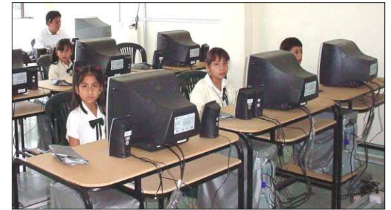
(Students of the D.S. Warner School Chepen, Peru)