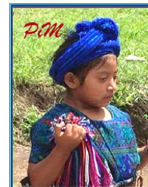
Mayan Girl - Guatemala